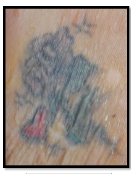
Right Thigh Tattoo

Subject was found in Shannon County, Missouri, on January 12, 2022.