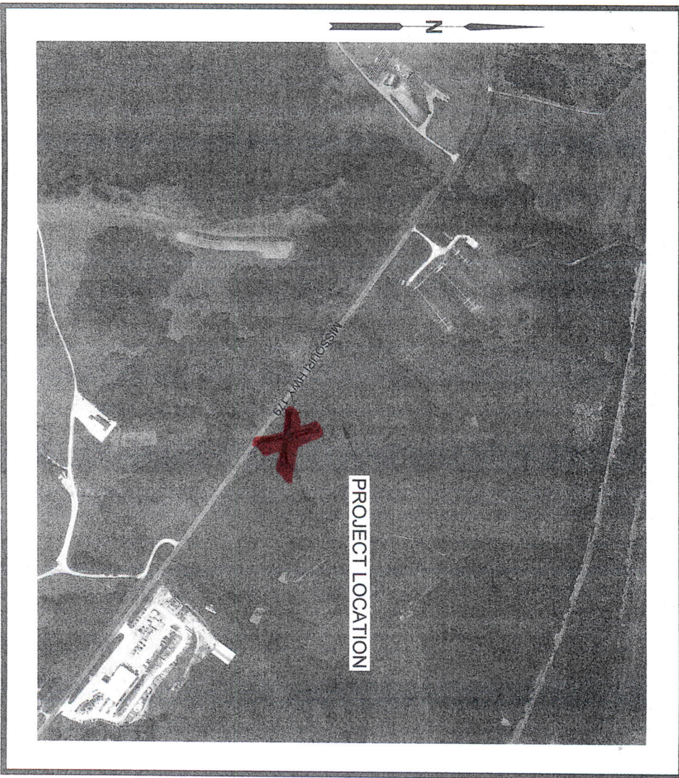
SITE LOCATION MAP N.T.S.